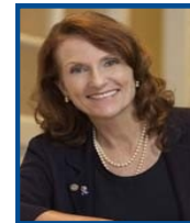
Commissioner Penny Taylor District 4