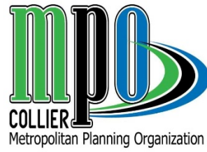
EXHIBIT A – APPLICATION MATERIALS