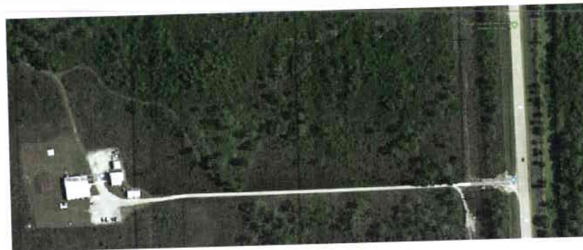
Expanded view of Red Oval