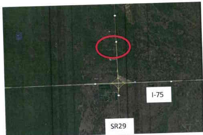
Fritz Road shown in Red Oval