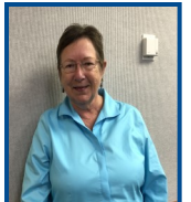
Councilwoman Elaine Middelstaedt Everglades City