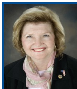
Commissioner Donna Fiala District 1