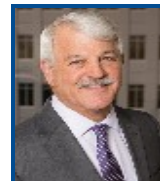
Commissioner Burt Saunders District 3